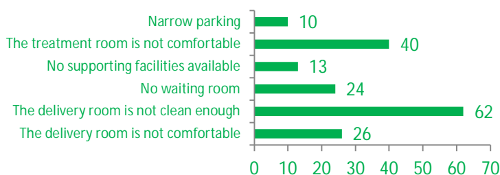
Figure 2. Factors causing inadequate service quality

The main reason why pregnant women were reluctant to give birth at Ngariboyo Health Center was the unfriendly service. This factor was then followed by the location being too far away, and the Health Center facilities being considered inadequate (Table 2). Most pregnant women (84%) did not choose Ngariboyo Health Center as a place to give birth because they considered the services provided to be less friendly. Factors contributing to this perception were the lack of attention from staff to patients and the lack of alertness of staff at the Health Center (Figure 1). In addition, the facilities at the Health Center were also considered less than satisfactory by 5.7% of respondents, citing the condition of the treatment room which was not clean and not comfortable (Figure 2). Meanwhile, 10.3% of respondents considered access to the Health Center too difficult, due to the long distance and poor road conditions (Figure 3).