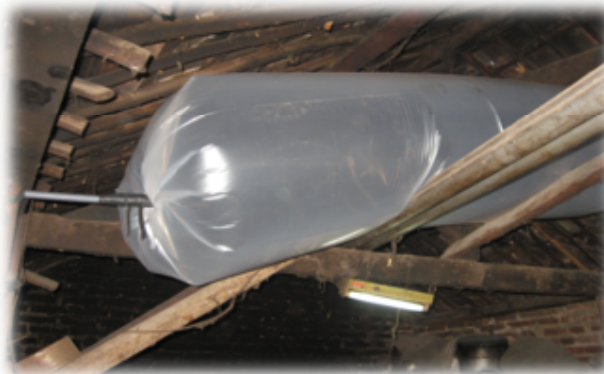
Figure 1. Biogas reactor design from polyethylene (PE) plastic bags